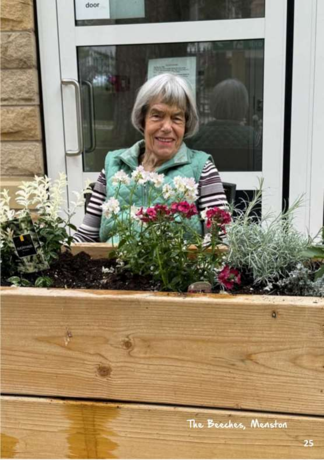
The Beeches, Menston