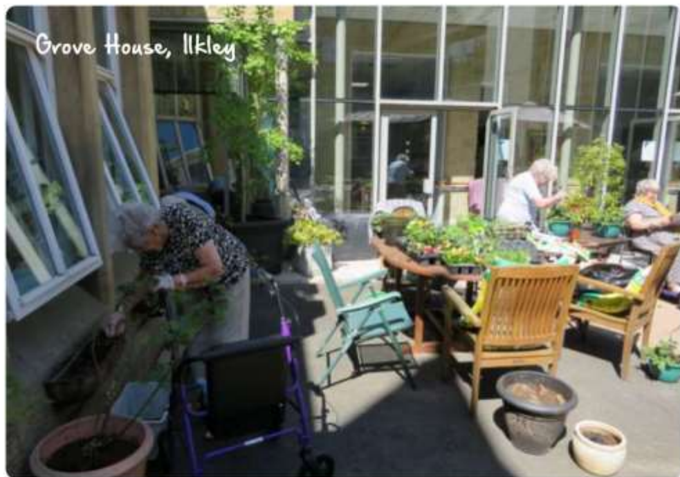
Grove House, Ilkley

Residents prepared for the beautiful summer ahead, as they plant some wonderful flowers. Staff and residents enjoyed a lovely afternoon planting up pots and hanging baskets to brighten up the garden and main entrance. To finish off the area around the fountain, residents painted pebbles .