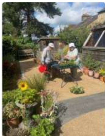
Fern House, Bingley